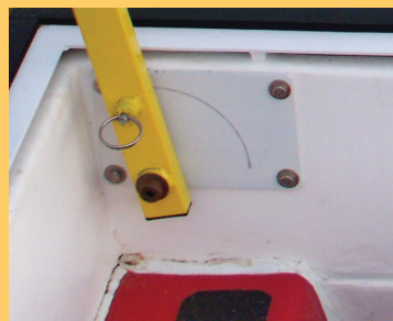
Extending handrail locks into place