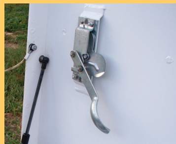
Heavy-duty locking mechanisms at three points