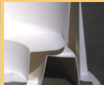
Half-inch molded polyethylene double-wall construction