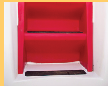
Molded 3-step ladder with non-skid

Ventilation: Molded 6-inch ventilation stack with optional solar-powered fan.