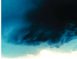
On the cover: A rotating wall cloud, such as the one shown here, is perhaps the strongest indication that a violent tornado is about to form in the immediate area.